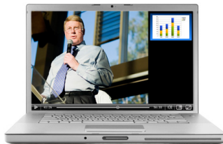
HD Streaming, Recording, Auto-publishing appliance